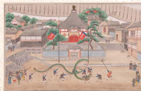
"Dragon Dance" from the Scroll of the Chinese Quarter by Keiga Kawahara / Courtesy of the Nagasaki Museum of History and Culture

There were roughly 20 two-story longhouses in the Chinese Quarter. People of high status such as the ship-owners lived on the second floors which were very well constructed. The crew and sailors would stay in the large room on the first floor. The parade in the upper portion of the photo is from the scenery of the reenactment of the Mazu Parade at the Nagasaki Lantern Festival. This road, which goes from Dojindo Shrine to Tenkodo Shrine, has over 300 years of history.