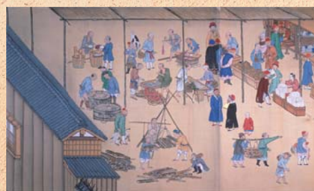
Scenes of the Chinese Quarter

The "Saishu Nagashi" is an event from China where models of Chinese ships which are decorated as offerings are burned in memorial of people who have passed away. Nagasaki's Shoro Nagashi (Spirit Boat Procession), which takes place every year on August 15, is said to have originated from this tradition.