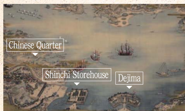
Port of Nagasaki by Okyo Maruyama *Depiction of the Port of Nagasaki in the Late Edo era

A great fire occurred within Nagasaki City in 1698. Around 20 ships worth of goods that were stored in storehouses in Kabashima-machi and Goto-machi were lost to the fire. As a result of this, in 1702, the merchants who owned the storehouses created the "Shinchi Storehouse" (present day Shinchi Chinatown). Since then, goods from the Chinese ships were stored in that storehouse. The Shinchi Storehouse was surrounded by a mud wall and on the south side there were four sluice gates. Goods would be brought in and sent out through these gates.