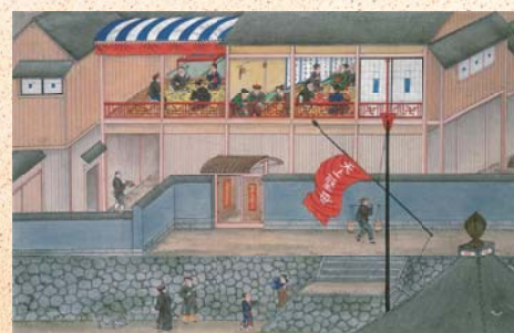
"Courtesans Providing Entertainment at the Chinese Quarter" from the Scroll of the Chinese Quarter by Keiga Kawahara

In the space between the Daimon and Ninomon, the Chinese residents would purchase foodstuffs and firewood, as well as copper goods. This was a plaza for commerce between the people of China and Nagasaki.