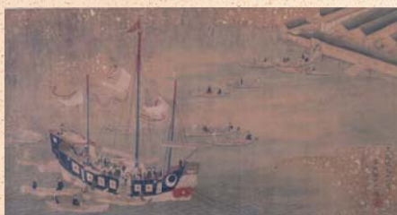
Scene of the Arrival and Trade of the Chinese Vessel by Yushi Ishizaki / Courtesy of the Nagasaki Museum of History and Culture

It is said that the first ship from China that arrived in Nagasaki came in 1562. In 1571, Nagasaki opened up its ports and soon after even more ships from China came to the city. Upon entering the Edo era, trade with Portugal and China flourished. In 1635, ships from China were prohibited from entering Japan except for the ports in Nagasaki. During Japan's period of foreign isolation, Nagasaki began trading with the Dutch in lieu of their previous trade with Portugal. But when compared to trade with China, revenue from trade with the Chinese was approximately more than double than that from the Dutch. Due to this, the economy of Nagasaki was greatly influenced by the number of Chinese ships that came to the city.