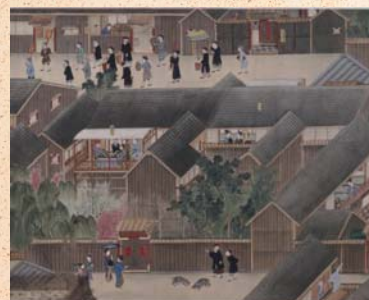
Scroll of the Chinese Quarter by Yushi Ishizaki / Courtesy of the Nagasaki Museum of History and Culture

Walk down the path of 300 years of history.