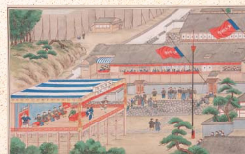
"Watching the Performances" from the Scroll of the Chinese Quarter by Keiga Kawahara

Of the Japanese people allowed within the Chinese Quarter were courtesans. Ensembles of courtesans playing the shamisen and Chinese people playing the erhu could be seen at the time. Also, many things came about through the influence of Chinese culture, such as having a meal while sitting and surrounding the dining table (the origin of Chabudai ) and the local Nagasaki cuisine of Shippoku Cuisine.