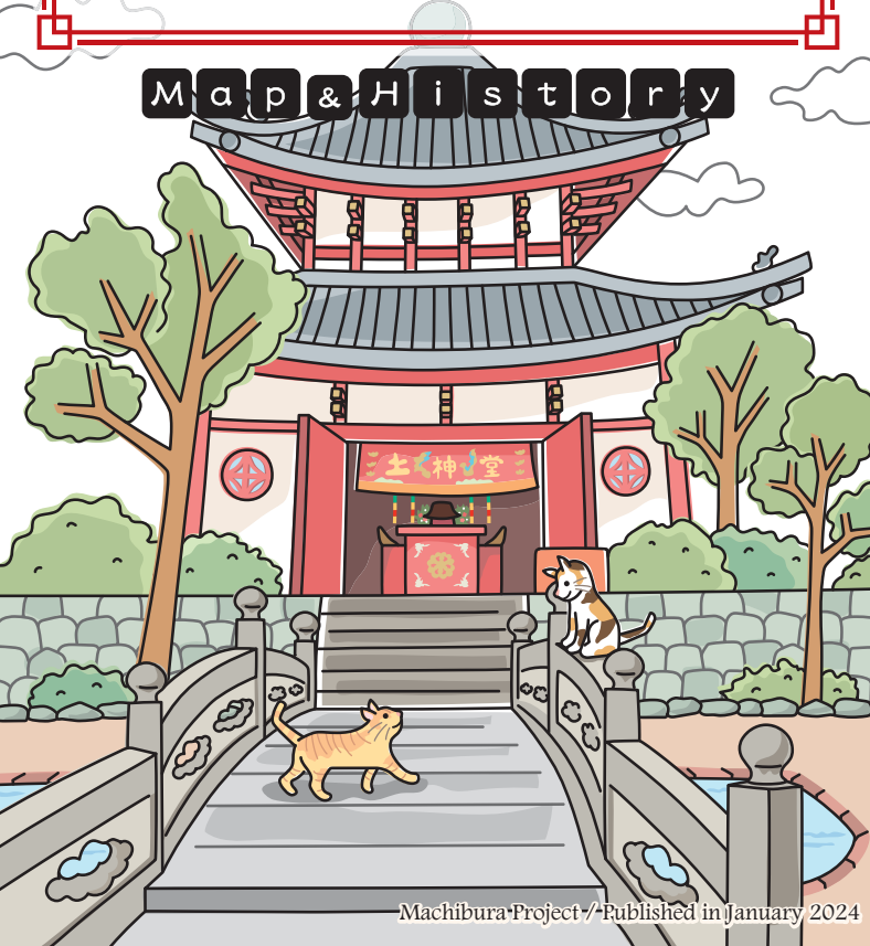
Machibura*Project / Published in January 2024