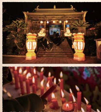
The Chinese Quarter During the Nagasaki Lantern Festival

The Nagasaki Lantern Festival was originally a celebration of the Chinese New Year (Spring Festival) by the Chinese immigrants which mainly took place in Shinchi Chinatown. Nowadays, it's become a staple event of the winter time in Nagasaki. During the festival, Chinatown and the heart of the city are decorated with roughly 15,000 Chinese paper lanterns. The Former Chinese Quarter becomes crowded with people, with events such as the "Candle Prayers Across Four Temples" taking place.