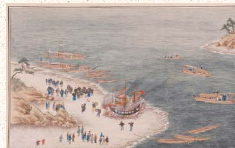
"Saishu Nagashi" from the Scroll of the Chinese Quarter by Keiga Kawahara

The Dragon Dance was a celebration that took place during the 15th day of the 1st lunar month. People from the town neighboring the Chinese Quarter, Kago-machi, learned this dance and today it is passed down as a ritual offering dance of the Kunchi Festival.