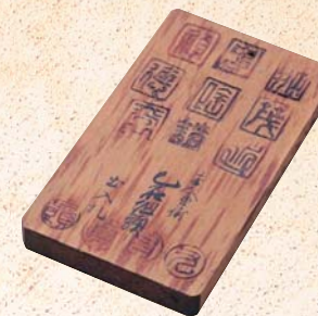
Gate Permit (1839)

If Japanese people wanted to go inside the Chinese Quarter, a gate permit was required. In the plaza between the two entrance gates to the quarter, the Daimon and Ninomon, Chinese people would purchase daily necessities, like fish and vegetables, lacquerware, and Imari porcelain from Japanese sellers. Gate permits were issued to merchants who had been granted permission to trade within the area. Aside from merchants, permits were also granted to builders for construction works as well as courtesans who were allowed entry up until the second gate, Ninomon.