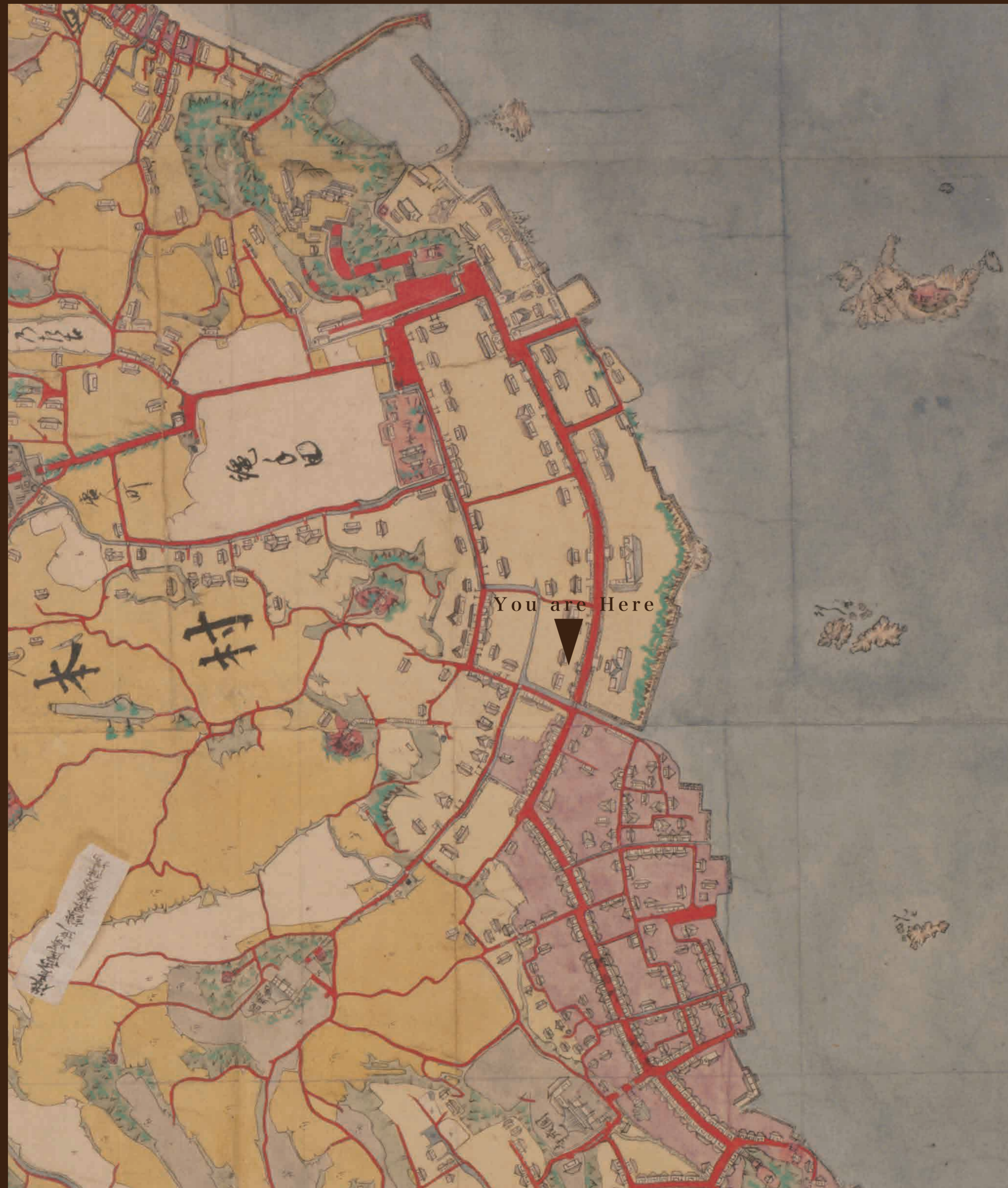
● A map of Honmura, Fukahori territory

A map of the Fukahori district in the Edo era (1861) and in the present are lined up next to each other. You can see from the map that the crescent-shaped streets which were created along the coastline before the Edo period and the waterways which spread from the mountains to the ocean, still remain today.