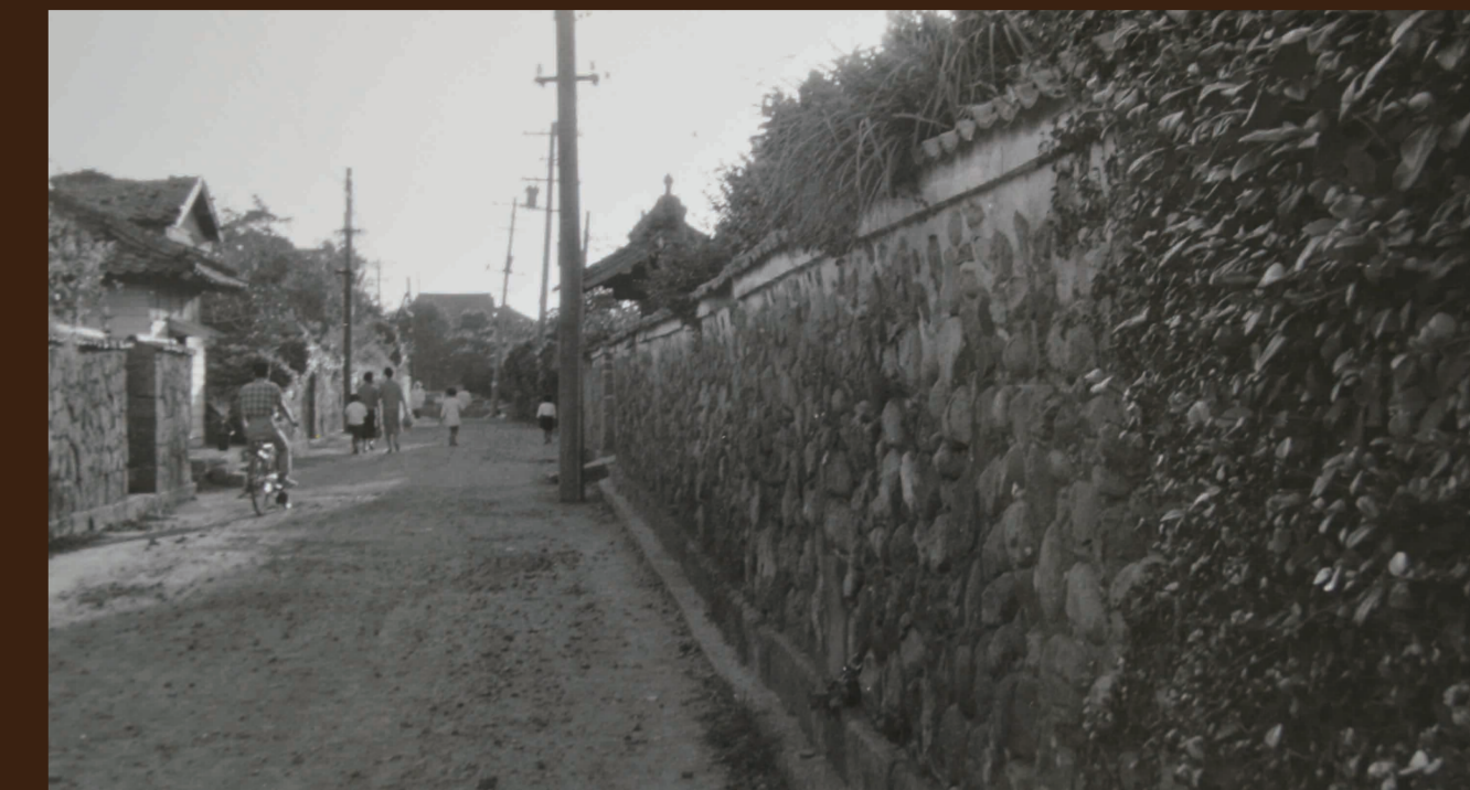
Former Samurai residents' street