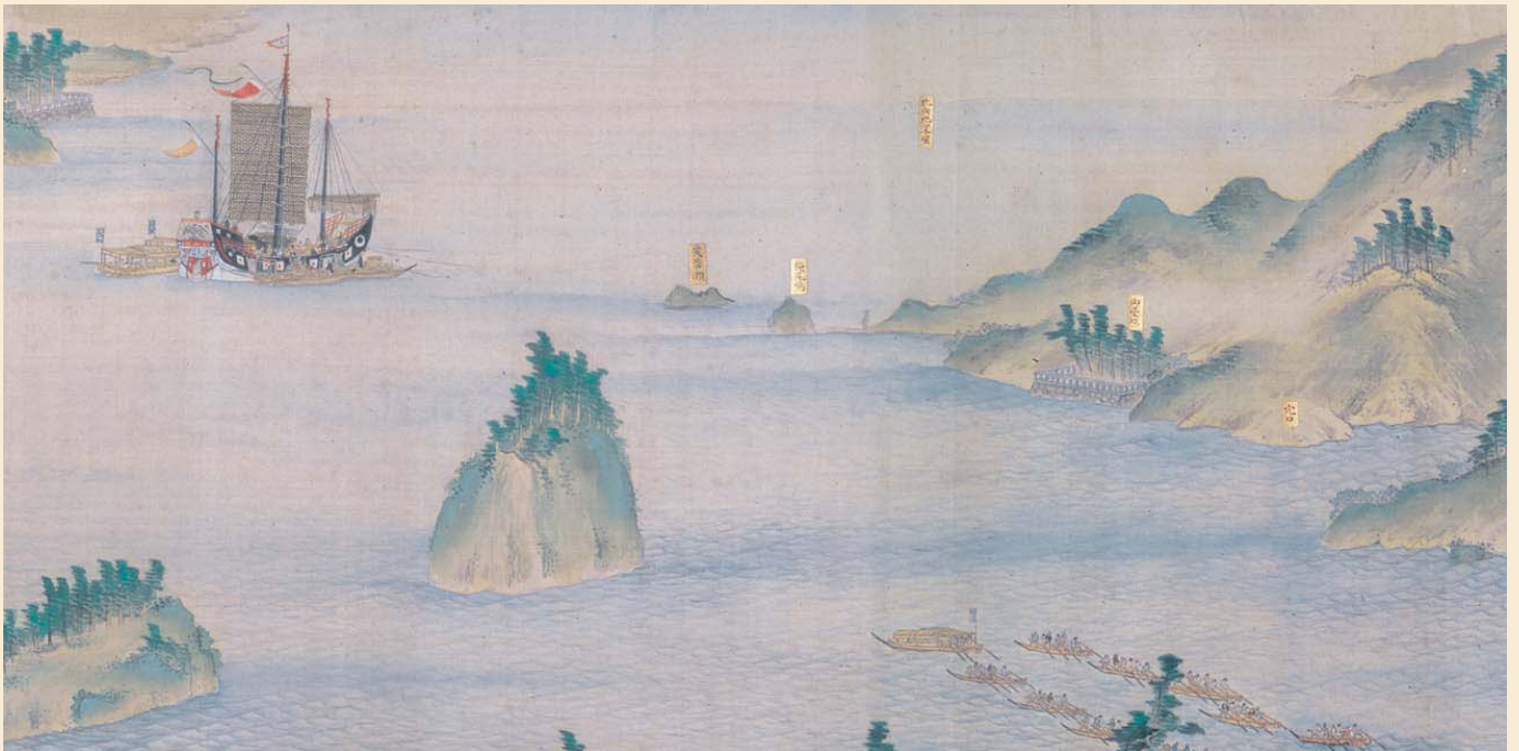
Chinese Ship Temporarily Moored at the Entrance to Nagasaki Port (Detail from “Scroll of the Chinese Quarter”) by Yushi Ishizaki, 1802 (Scroll: Color on silk, 42.5 x 790.0cm). Nagasaki Museum of History and Culture