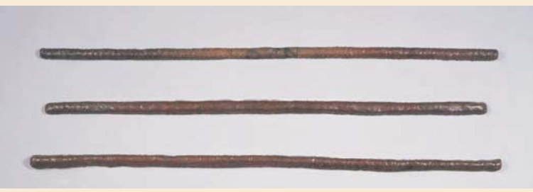
Saodo (Pole Copper) Copper is 75cm long x 3cm wide. Nagasaki Museum of History and Culture