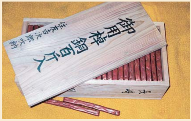
Wooden Box Containing 100 kin (approximately 60kg) of Saodo ("pole copper") (replica) Copper is 21cm long x 2cm wide. Nagasaki City Board of Education

At the beginning of the Edo period, Japan's main export aboard Chinese ships was silver. Japan was a prominent producer of good quality silver from the late-16 th century to the beginning of the 17 th century. Gold coins were also exported. However, as they were of poor quality they were not widely sought after. Copper and marine produce then replaced silver and gold as the next great exports. Marine produce such as dried sea cucumber, dried abalone, and shark's fin, was exported wrapped in straw. Other popular exports included camphor (as an insect repellent) and seafood, ceramics, lacquerware, and copper products.