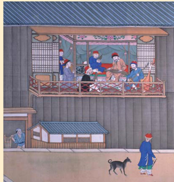
Performance of Minshin-gaku Music (Chinese music of the Ming and Qing dynasties) (Detail from “Scroll of the Chinese Quarter”) Artist Unknown.