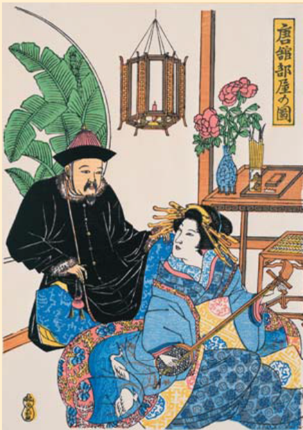
Old Woodblock Print of Nagasaki/ View of a Room in the Chinese Quarter

Published by Yamatoya, late Edo period (19 th Century) (Color printed on paper, 34.0cm x 25.0cm).